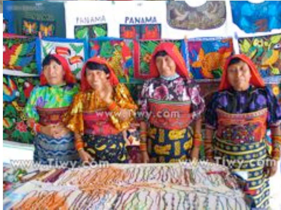
Gunás indigenous group