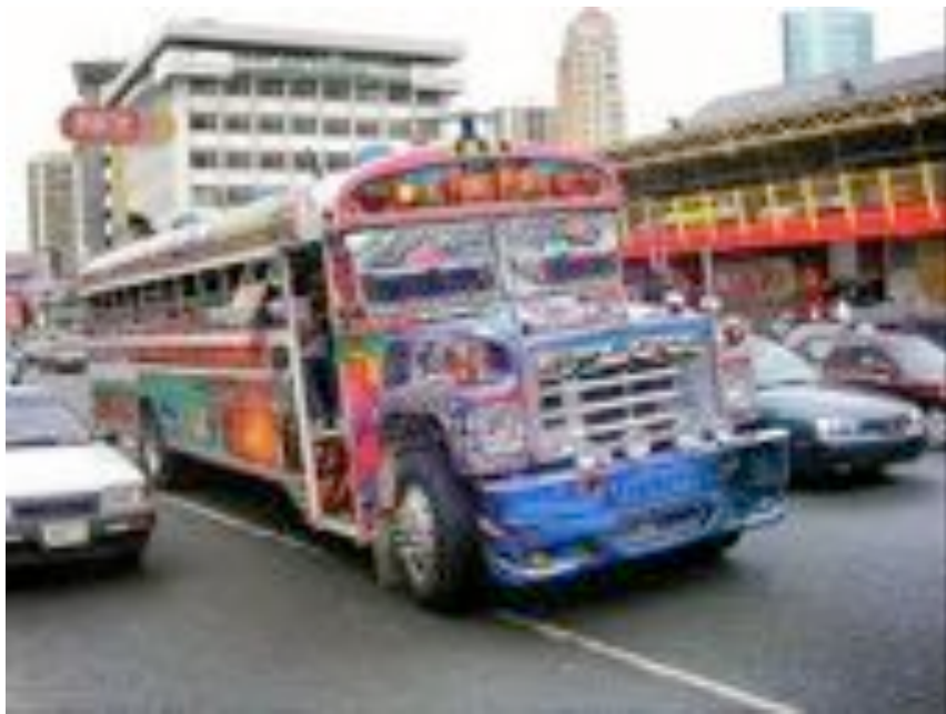
“Diablos rojos” Red devils