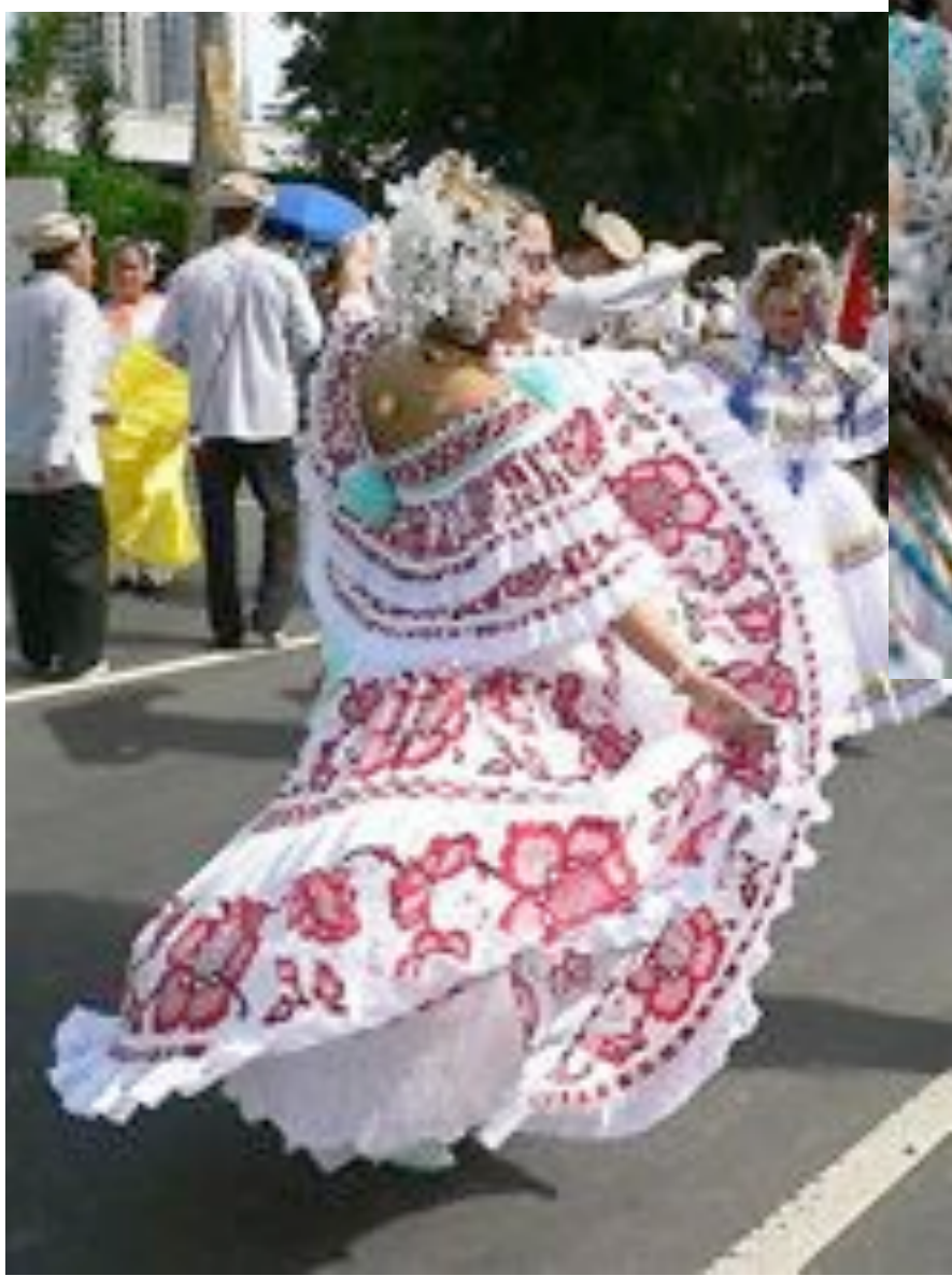
The "pollera" national costume