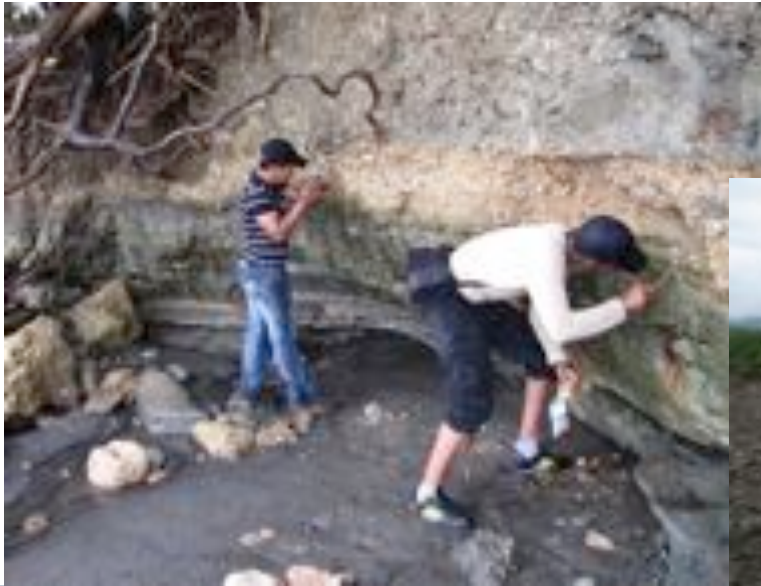
Involving and building local capacity