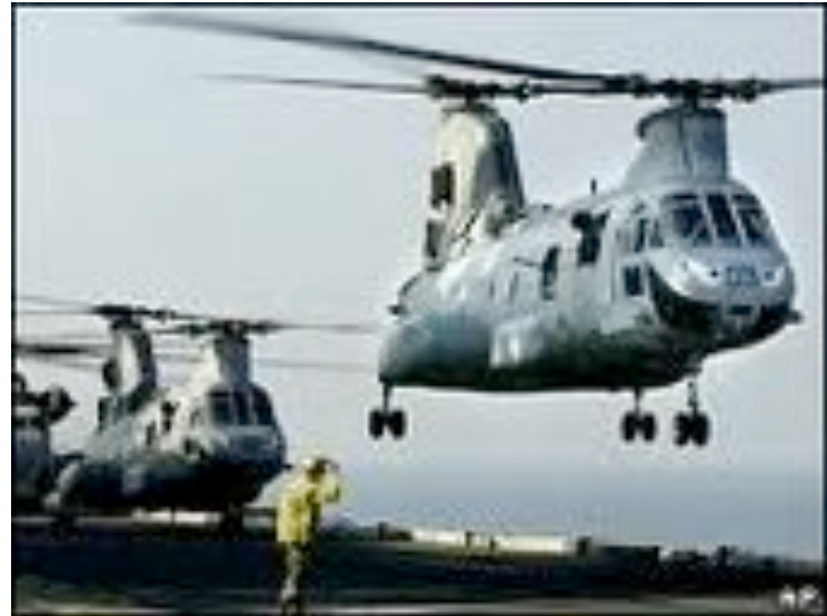
Military intervention in 1989