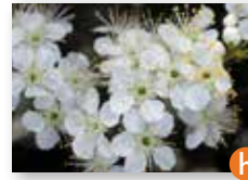
Hog Plum ( Prunus umbellata )