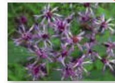
Giant Ironweed ( Vernona gigantea )