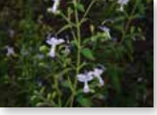
Blue Curls ( Trichostema dichotomum )