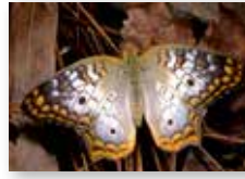
White Peacock ( Anartia jatrophae )