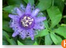
Purple Passionflower ( Passiflora incarnata )