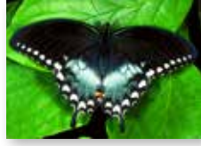
Spicebush Swallowtail ( Papilio troilus )