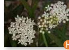
Aquatic Milkweed ( Asclepias perennis )