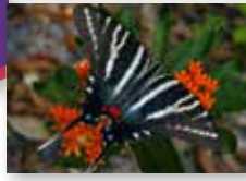
Zebra Swallowtail ( Eurytides marcellus )