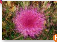
Bristle Thistle ( Cirsium horridulum )