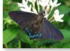
Mangrove Skipper ( Phocides batabano )