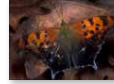
Question Mark ( Polygonia interrogationis )