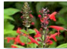
Tropical Sage ( Salvia coccinea )