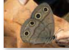
Little Wood Satyr ( Megisto cymela )