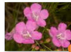
Beach False Foxglove ( Agalinis fasciculata )