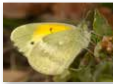
Dainty Sulphur ( Nathalis iole )