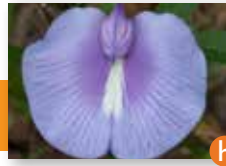
Spurred Butterfly Pea ( Centrosema virginianum )