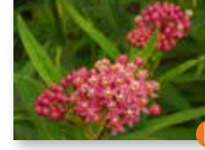
Swamp Milkweed ( Asclepias incarnata )