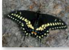
Black Swallowtail ( Papilio polyxenes )