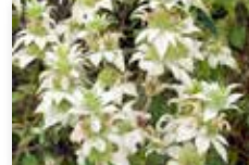
Spotted Horsemint ( Monarda punctata )