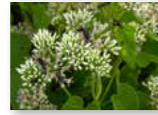
Climbing Hempvine ( Mikania scandens )