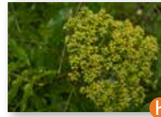
Hercules Club ( Zanthoxylum clava-herculis )