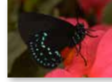
Atala ( Eumaeus atala )