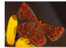
Little Metalmark ( Calephelis virginensis )