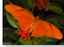
Julia Heliconian ( Dryas iulia )