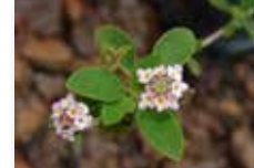
Button Sage ( Lantana involucrata )