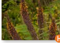
False Indigo Bush ( Amorpha fruticosa )