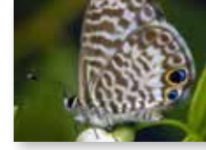
Cassius Blue ( Leptotes cassius )