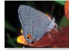
Gray Hairstreak ( Strymon melinus )