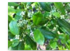
Dahoon Holly ( Ilex cassine )