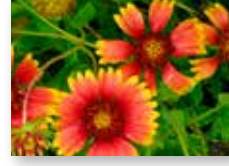
Firewheel ( Gaillardia pulchella )