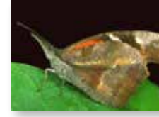
American Snout ( Libytheana carinenta )