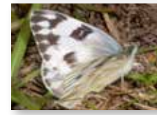
Checkered White ( Pontia protodice )