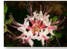
Mountain Azalea ( Rhododendron canescens )