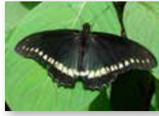
Polydamus Swallowtail ( Battus polydamas )