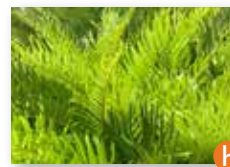
Coontie ( Zamia integrifolia )