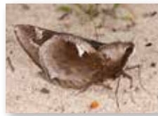
Yucca Giant-Skipper ( Megathymus yuccae )