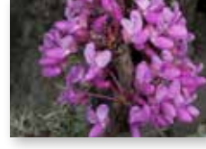
Eastern Redbud ( Cercis canadensis )