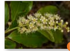
Black Cherry ( Prunus serotina )