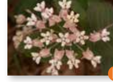
Sandhill Milkweed ( Asclepias humistrata )