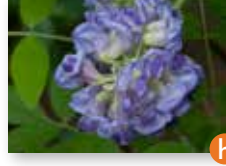
American Wisteria ( Wisteria frutescens )