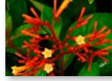
Firebush ( Hamelia patens )