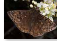
Horace's Duskywing ( Erynnis horatius )