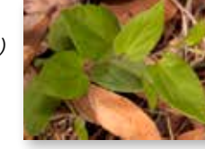
Virginia Snakeroot ( Aristolochia serpentaria )