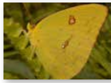
Cloudless Sulphur ( Phoebis sennae )