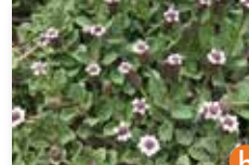
Turkey Tangle Fogfruit ( Phyla nodiflora )