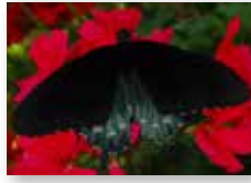
Pipevine Swallowtail ( Battus philenor )