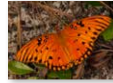
Gulf Fritillary ( Dione vanillae )