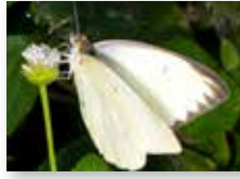
Great Southern White ( Ascia monuste )