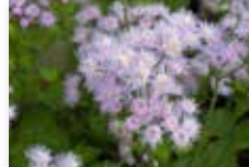
Blue Mistflower ( Conoclinium coelestinum )