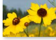
Leavenworth's Tickseed ( Coreopsis leavenworthii )