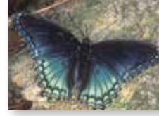
Red-spotted Purple ( Limenitis arthemis astyanax )