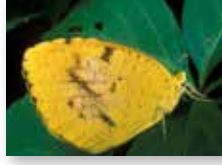
Sleepy Orange ( Eurema nicippe )