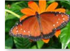
Queen ( Danaus gilippus )