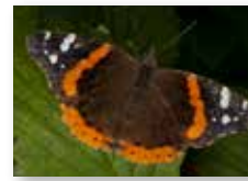
Red Admiral ( Vanessa atalanta )