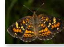
Phaon Crescent ( Phyciodes phaon )