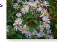
Elliott's Aster ( Symphyotrichum elliottii )