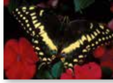
Palamedes Swallowtail ( Papilio palamedes )