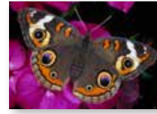
Common Buckeye ( Junonia coenia )