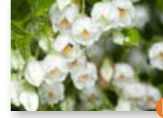
Sparkleberry ( Vaccinium arboreum )