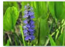
Pickerelweed ( Pontederia cordata )