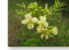
Privet Senna ( Senna ligustrina )