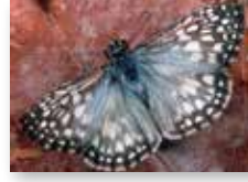
Tropical Checkered-Skipper ( Burnsius oileus )