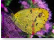
Little Yellow ( Eurema lisa )