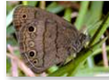
Carolina Satyr ( Hermeuptychia sosybius )