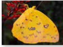
Orange-barred Sulphur ( Phoebis philea )