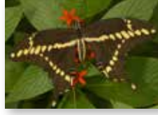
Eastern Giant Swallowtail ( Heraclides cresphontes )