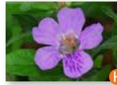
Oblongleaf Snakeherb ( Dyschoriste oblongifolia )