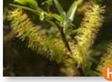
Carolina Willow ( Salix caroliniana )