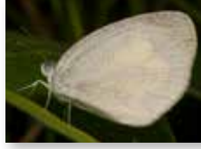
Barred Yellow ( Eurema daira )