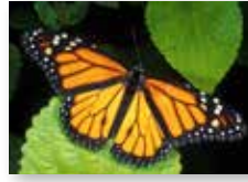
Monarch ( Danaus plexippus )