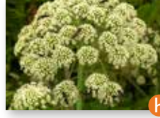
Spotted Water Hemlock ( Cicuta maculata )