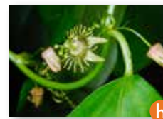
Corkystem Passionflower ( Passiflora suberosa )