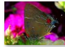
White M Hairstreak ( Parrhasius m-album )