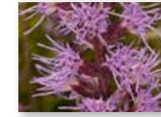
Dense Blazing Star ( Liatris spicata )