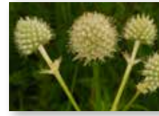
Rattlesnake Master ( Eryngium yuccifolium )