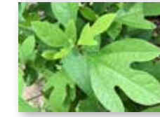
Sassafras ( Sassafras albidum )