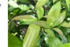
Redbay ( Tamala borbonica )