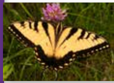
Eastern Tiger Swallowtail ( Papilio glaucus )