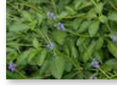
Blue Porterweed ( Stachytarpheta jamaicensis )