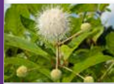
Buttonbush ( Cephalanthus occidentalis )