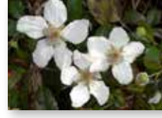
Southern Dewberry ( Rubus trivialis )