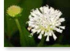
Snow Squarestem ( Melanthera nivea )