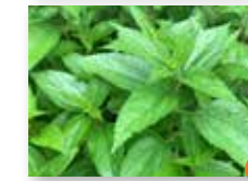
False Nettle ( Boehmeria cylindrica )