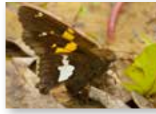
Silver-spotted Skipper ( Eparargyreus clarus )