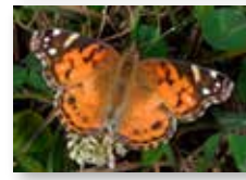
American Lady ( Vanessa virginensis )