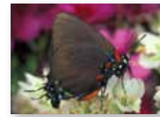
Great Purple Hairstreak ( Atlides halesus )