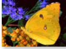
Southern Dogface ( Zerene cesonia )