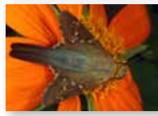
Long-tailed Skipper ( Urbanus proteus )