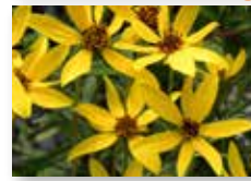
Narrowleaf Sunflower ( Helianthus angustifolius )