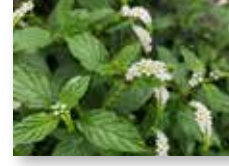
Scorpion's-Tail ( Heliotropium angiospermum )