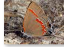
Red-banded Hairstreak ( Calycopis cecrops )