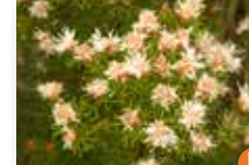
Summer Farewell ( Dalea pinnata )