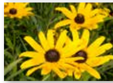
Blackeyed Susan ( Rudbeckia hirta )