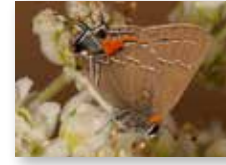
Southern Oak Hairstreak ( Satyrion favonius )