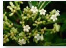
Shiny-leaved Wild Coffee ( Psychotria nervosa )