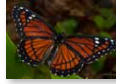
Viceroy ( Limenitis archippus )