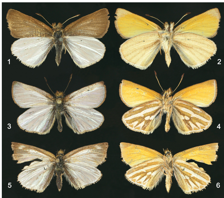
Figures 1-6. Dalla adults. 1) Dalla semiargentea , male, Colombia, 1931, dorsal surface; 2) D. semiargentea , male, same specimen as Fig. 1, ventral surface; 3) D. superargentea , holotype male, dorsal surface, data in text; 4) D. superargentea , holotype male, ventral surface; 5) D. superargentea , paratype female, dorsal surface, data in text; 6) D. superargentea , paratype female, same specimen as Fig. 5, ventral surface.

Genitalia (Fig. 10) - uncus in lateral view narrow, concave caudad of middle, strongly hooked caudad; in dorsal view narrow caudad, divided, arms parallel and closely spaced, expanding greatly cephalad to overlap large portion of tegumen as suboval plate possessing white hair tuft; gnathos shorter than uncus, narrow in lateral view, narrowing slightly caudad, interrupted by membranous area before a short sclerotized tip caudad, broad proximad in ventral view, narrowing gradually to undivided caudal end; tegumen broadly curved cephalad; combined ventral arm of tegumen and dorsal arm of saccus nearly straight; cephalic arm of saccus moderately long, thin, and curved dorsad in lateral view, cephalic end blunt in ventral view; valvae slightly asymmetrical, long ( 1.3\times length of tegumen and uncus), length about 2.6\times width, costa concave on dorsal edge toward caudal end, ampulla elongate (longer than costa), and relatively broad (length 2.1\times width), right ampulla longer and broader than left, angled dorsad, narrowing caudad to blunt caudal end, setose on both surfaces especially caudad, harpe curved dorsad and slightly inward to blunt caudal end, exceeding caudal extent of ampulla, dorsal edge finely serrate; juxta-transstilla prominent with lobate dorsal edge in lateral view, suboval in ventral view; aedeagus unadorned, moderately sinuate in lateral view, nearly straight in