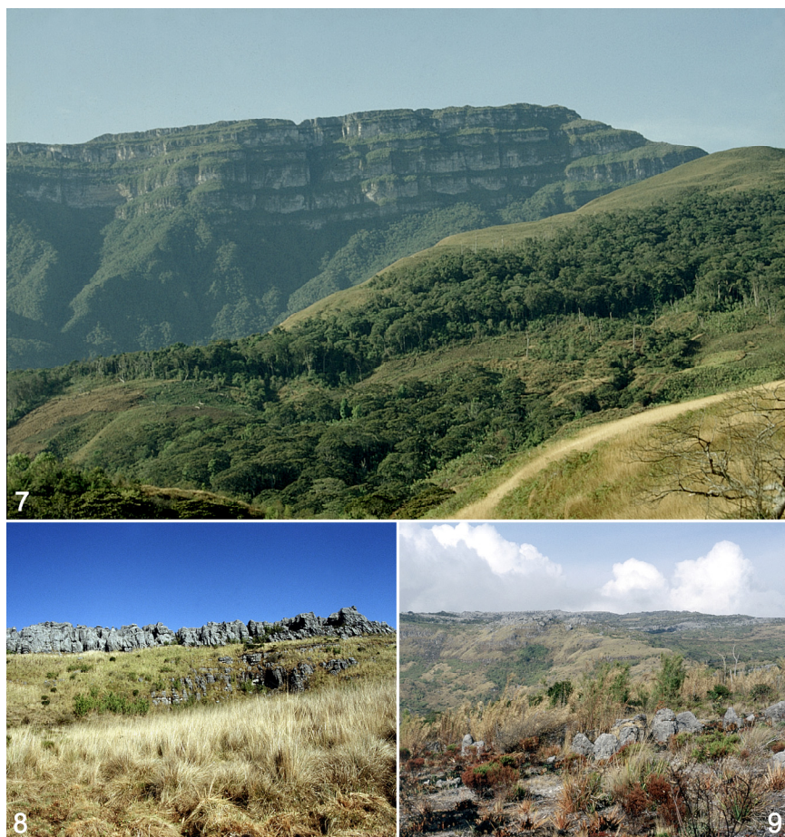
Figures 7-9. Cerro Pintado on the Colombian-Venezuelan border. 7) View of the Colombian slopes of the Cerro Pintado, a monumental limestone table that reaches 3300m in the Sierra de Perijá; 8) view of the paramo of Cerro Pintado with limestone blocks emerging on top (2-10m in height); yellow grasses are conspicuous during the dry season, but Chusquea remains green; 9) type locality of Dalla superargentea in the paramo of Cerro Pintado (3000-3300m); some clumps of green Chusquea can be seen to the right.