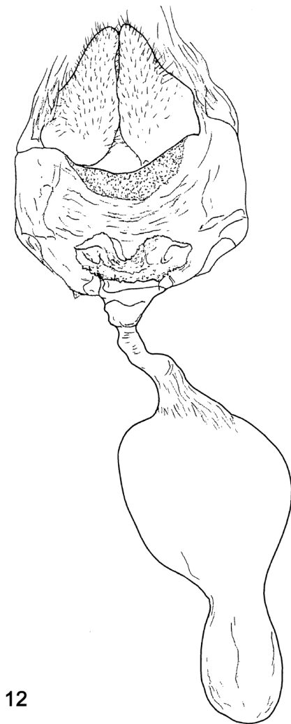
Figure 12. Female genitalia of Dalla superargentea , paratype, ventral view (GTA #14099).