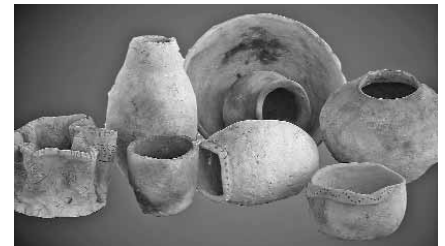
A selection of some of the many pots made by visitors during Calusa Heritage Day. The pots were fired March 1 and can be picked up at the Calusa Heritage Trail (phone 283-2157).