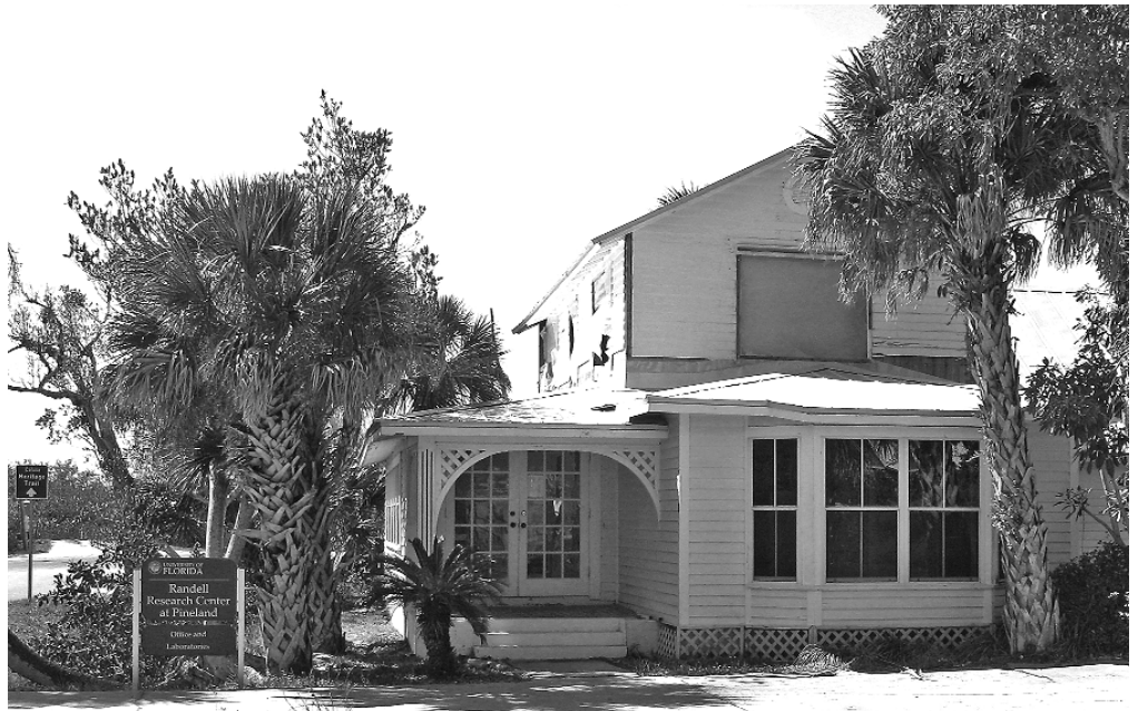
The Ruby Gill House, viewed from the east, March, 2008. Restoration work will resume as soon as we can raise $31,000.

To contribute to the building fund, simply make your check payable to Randell Research Center , indicate that it is for the building fund, and mail it to P.O. Box 608, Pineland, Florida 33945. Donations in any amount are welcome. Like all donations to the Randell Research Center, your gift is tax-deductible to the extent allowed by Federal law, and all donations to the building fund will be matched by the Millers and Sipprelles up to $50,000.