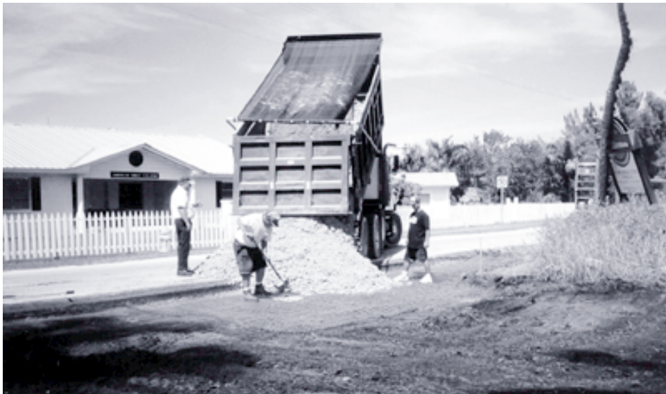
First load of base dirt is dumped at new entranceway to the Pineland Site by Bill Mullen of Williams-Mullen Trucking.