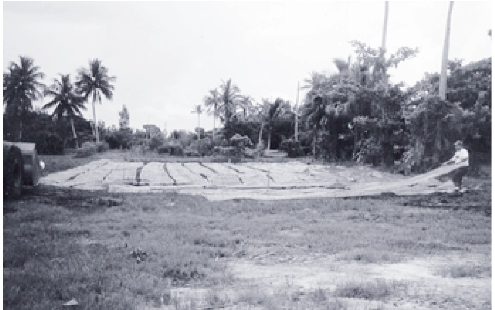
Protective plastic barrier sheets are applied over archaeological sediments in the area of the new teaching pavilion complex.

Costs for the pavilion complex are $577,000. So far, we have $408,000. In order to complete and equip the classroom, where our school programs and public lectures will take place, we must raise an additional $169,000. Please consider a special donation to the building fund. Make checks payable to Randell Research Center, and send to PO Box 608, Pineland, Florida 33945. Gifts in any amount are welcome, and are tax-deductible to the extent allowed by federal law. For more information, contact John Worth at (239) 283-2062.