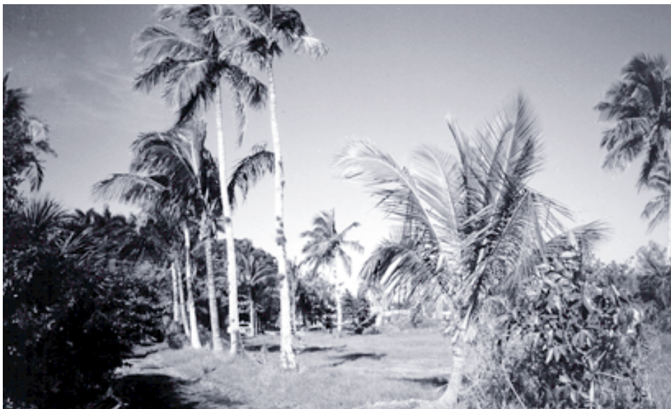
View of palm-lined roadway near RRC teaching pavilion construction site, restored by Mark Dean of PalmCo., Inc.