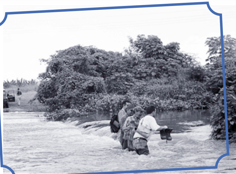
Author and companions struggle to cross Arimao River at flood stage before hike to archaeological site.