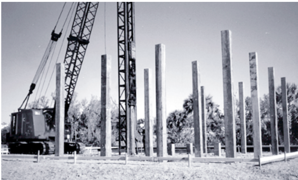
Wooden piles were driven for the teaching pavilion structure by Island Piling and were cut by Gatewood Custom Carpentry.