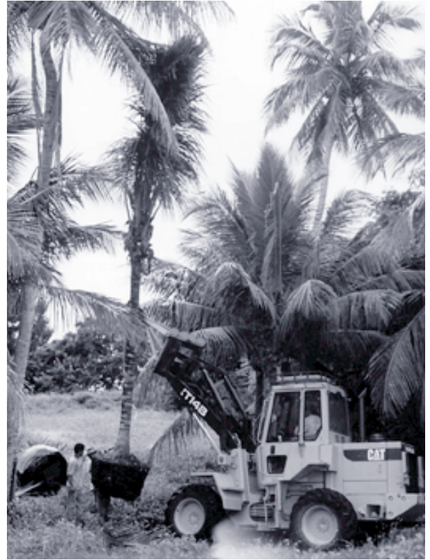
Coconut palms are removed from the front of Randell Mound to provide an unobstructed view of Pine Island Sound from atop the mound. Work donated by PalmCo, Inc. of Pine Island.