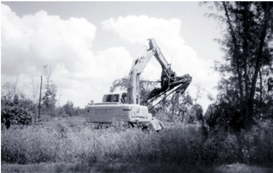
Australian pines along Waterfront Drive are removed by Treeland Solutions, Inc. of Pine Island.

During the late summer and fall , the Randell Research Center has finally witnessed a flurry of activity associated with the construction of the teaching pavilion complex and parking area, as well as the relocation of a number of coconut palm trees to restore the old historic roadway to the early 20th-century packing house at Pineland. The photos below will update readers on our ongoing progress.