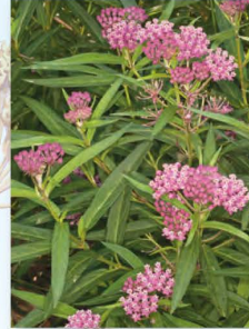
Asclepias incarnata Swamp milkweed

Habitat moist to wet soils: swamps, wet woods, roadside ditches, pond margins