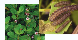
Phaon Crescent Phycodes phaon Turkey Tangle Fogfruit Phyla nodiflora