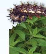
Red Admiral Vanessa atalanta False Nettle Boehmeria cylindrica