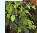
Question Mark Polygonia interrogationis Sugarberry Celtis laevigata