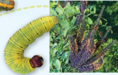
Silver-spotted Skipper Epargyreus clarus Bastard False Indigo Amorpha fruticosa