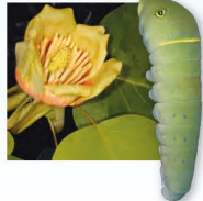
Eastern Tiger Swallowtail Papilio glaucus Tuliptree Liriodendron tulipifera