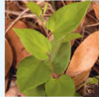
Pipevine Swallowtail Battus philenor Virginia Snakeroot Aristolochia serpentaria