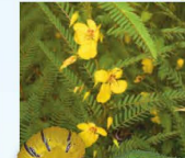
Cloudless Sulphur Phoebis sennae Partridge Pea Chamaecrista fasciculata