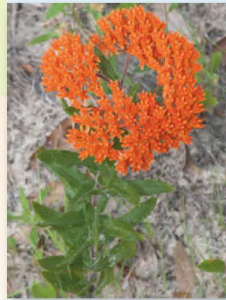
Asclepias tuberosa Butterflyweed

Habitat dry soils: open woods, fields, roadsides