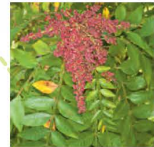
Red-banded Hairstreak Calycopis cecrops Winged Sumac Rhus copallinum