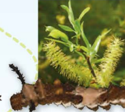
Viceroy Limenitis archippus Carolina Willow Salix caroliniana