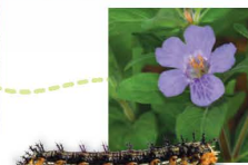
Common Buckeye Junonia coenia Oblongleaf Twinflower Dyschoriste oblongifolia