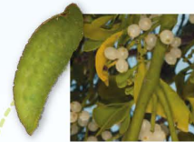
Great Purple Hairstreak Athides halesus Oak Mistletoe Phoradendron leucarpum