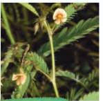
Barred Yellow Eurema daira Shyleaf Aeschynomene americana