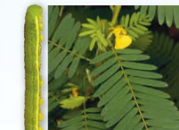
Little Yellow Eurema lisa Sensitive Pea Chamaecrista nictitans