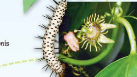
Zebra Longwing Heliconius charitonia Corkystem Passionflower Passiflora suberosa