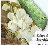
Zebra Swallowtail Eurytides marcelus Woolly Pawpaw Asimina incana