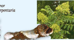
Giant Swallowtail Heracles crespontes Hercules-Club Zanthoxylum clava-herculis