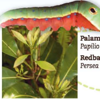
Redbay Persea borbonia

Florida Museum of Natural History UF Cultural Plaza 3215 Hull Road Gainesville, FL 32611-2710 352-846-2000 www.fimnh.ufl.edu