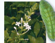
Cassius Blue Leptotes cassius Doctorbush Plumbago zeylanica