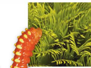
Atala Eumaeus atala Coontoe Zamia pumila