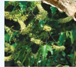
Red-spotted Purple Limenitis arthemis astyanax Black Cherry Prunus serotina