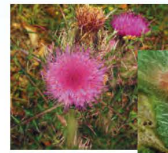
Little Metalmark Calephelis virginiensis Purple Thistle Cirsium horridulum