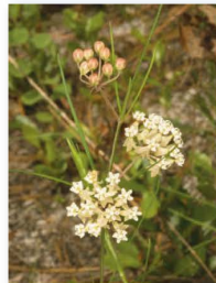
Asclepias verticillata Whorled milkweed

Larval host plant, adult nectar source. Plants and seeds are available from limited vendors.