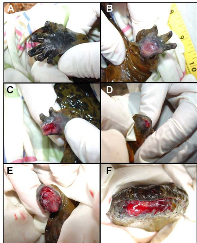
Figure 2. Representative samples of normal and abnormal lesions on Ozark Hellbenders, Cryptobranchus alleganiensis bishopi . All individuals sampled were captured from the North Fork of the White River, Ozark County, Missouri on 17 August 2007. A shows a normal left back foot (NFWR 138), B shows lesion on palm of right back foot (NFWR 136), C shows lesion on toes of left front foot (NFWR 136), D shows lesion on right back limb with all toes missing (NFWR 135), E shows lesion on right back limb with all toes missing (NFWR 139), and F shows lesion on lower lip (NFWR 139). doi:10.1371/journal.pone.0028906.g002