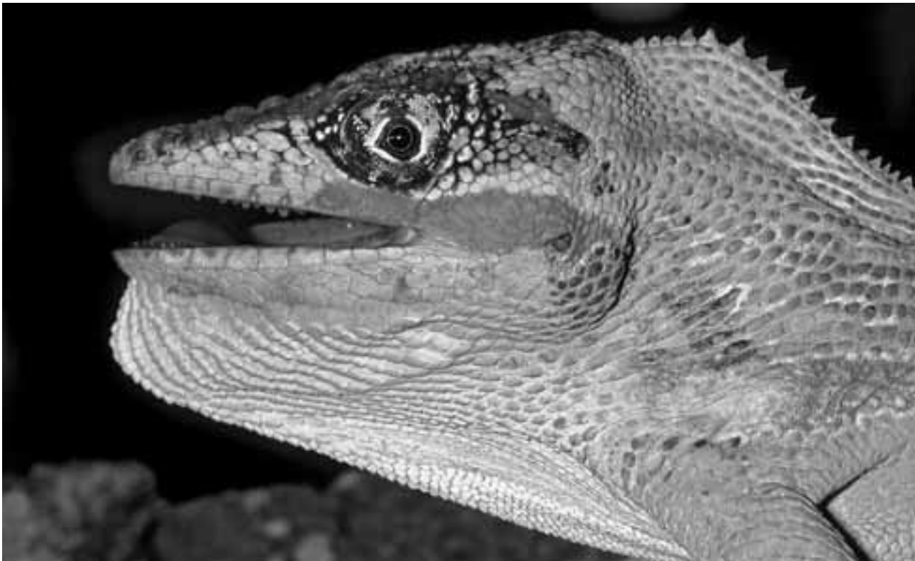
Juvenile Anolis equestris (UF 131530) from Port Mayaca, Martin County, Florida, found sleeping on low vegetation.