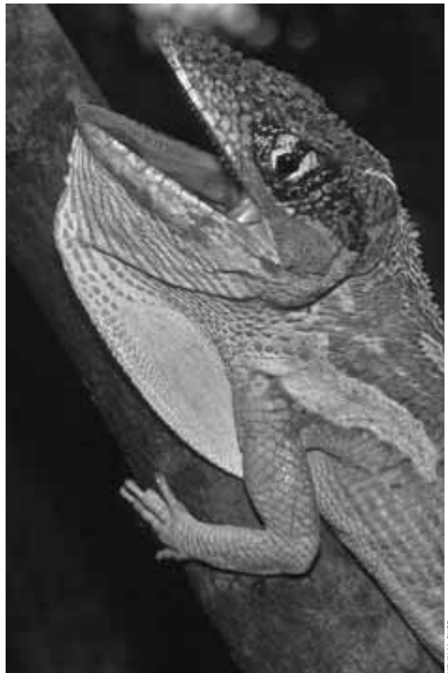
The nonindigenous Knight Anole ( Anolis equestris ) is the largest and most ornate established Anolis in Florida. This specimen (UF 137459) is from Allapattah Flats, St. Lucie County, Florida.

The nonindigenous Knight Anole, Anolis equestris Merrem 1820, is the largest and most ornate established representative of the genus Anolis in Florida. In its native Cuban range, where it is known as a “chipoyo,” this species can measure up to 179 mm snout-vent length (SVL) in males and 167 mm SVL in females (Schwartz and Ogren 1956, Garrido and Schwartz 1972, Schettino 1999). In its introduced range in Miami-Dade County, Florida, males typically are 100–190 mm SVL and females 90–160 mm SVL, with individual masses of 16–84 g (Dalrymple 1980). Anolis equestris has large, flat and smooth, non-imbricate (i.e., non-overlapping) dorsal scales that are separated by small, granular interstitial scales; small, circular and smooth ventral scales; digits with widened, smooth subdigital lamellae; a pinkish-white dewlap present in both genders; and a large head with distinct canthal and frontal ridges (especially in adults). Both juveniles and adults are bright green, with yellow stripes below the eyes and others extending onto the shoulder. These lizards are capable of metachromatic color change (pers. obs., Schwartz and Garrido 1972, Schwartz and Henderson 1991, Schettino 1999). However, hatchlings and juveniles have cream-colored transverse bands along the body. Because of its green body coloration and large size, A. equestris is occasionally mistaken for the Green Iguana ( Iguana iguana Linnaeus 1758)