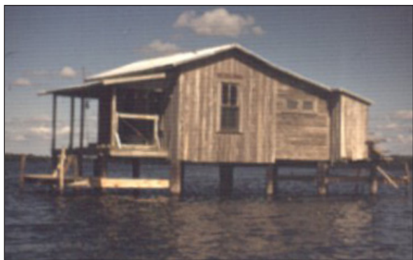
Fish Cabin at White Rock Shoals (used ca. 1920–1941) near St. James City, as it appeared in 1960.

The Ice House at Point Blanco sold in 1980 to private owners. It burned on July 1, 1995, just after a state constitutional amendment went into effect banning the use of entanglement nets. Today only the tops of the pilings can be seen at the southeastern end of Punta Blanca, slightly charred, and often crowned by pelicans and cormorants.