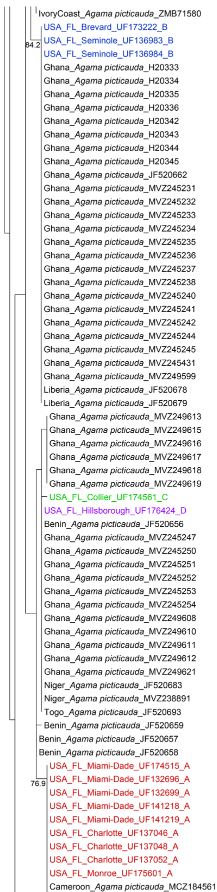
Figure 3. Enlarged area of introduced populations of Agama in Florida using Maximum Likelihood analysis and data set of Leaché et al. (2014). Note that values above major nodes represent bootstrap support \geq 70\% ; and samples highlighted in red, blue, green, and purple represent different haplotypes for specimens collected from introduced populations in Florida.