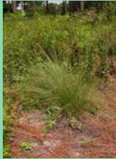
Wiregrass: blooming after a controlled burn

This habitat is found in hilly areas in the northern, central and panhandle regions of Florida. A typical upland pine ecosystem consists of widely spaced longleaf pines, limited shrubs and dense grasses. The sandy soil is well drained which allows for movement of water into aquifers. Before European settlement, upland pine and other longleaf pine ecosystems covered an estimated 90 million acres in southeastern United States. Today only about 3% of these acres remain in longleaf pine, because after the extreme logging of 1870 to 1930, fires were suppressed and the land was converted to other uses.