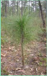
Longleaf pine: rocket stage