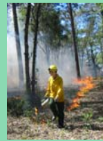
Setting a fire with a drip torch during a controlled burn

Longleaf pines and wiregrass depend on frequent fires to suppress competing plants. The shed needles of longleaf pine and the leaves of wiregrass are highly flammable and promote the needed fires. Longleaf pine development is keyed to frequent fires. For four or more years, seedling longleaf pines remain in a "grass stage" that resembles a bunch of grass. This stage is protected from fire because its bud remains in the ground. The "rocket stage" develops when the below ground parts have stored enough food to allow the bud to grow quickly to a safe height on a thick, fire-resistant stem.