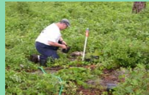
A volunteer plants wiregrass