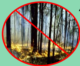
Fire is suppressed