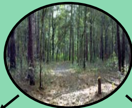
Effects of fire suppression begin to show as pines and grasses are shaded-out

Since 1995 volunteers have worked to restore NATL's upland pine ecosystem. Prescribed burns have killed hardwoods and other invading plants. Girdling and cutting have sped the process of removing laurel-oak trees. Afterwards, mechanical means and herbicides have reduced dense growths of laurel-oak root sprouts. This has allowed transplanted wiregrass and young longleaf pines to survive. Finally, early in 2006, thousands of longleaf seeds germinated naturally and some have survived and are growing.