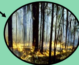
Fire is allowed or prescribed