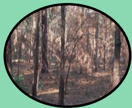
Conditions worsen as hardwoods take over