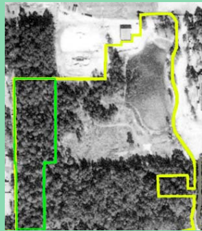
1990 aerial photo of NATL's public-area upland pine (outlined in green) After 50 years of fire suppression laurel oaks dominate

The health of upland pine depends on frequent, low-intensity fires. When fire is not allowed to burn this ecosystem, laurel oaks and other hammock species invade and create shade and deep leaf litter. These make it impossible for wiregrass to survive and for longleaf pines to reproduce. Most longleaf seeds do not germinate because there is little exposed soil, and seedlings perish for lack of sufficient sunlight. When NATL began in 1994, its upland pine consisted of mature longleaf pines projecting above a canopy of laurel oaks. No wiregrass or young longleaf pines grew beneath.