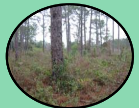
Ecosystem nearly restored