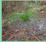
Longleaf pine: grass stage