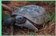
Gopher tortoises make burrows in upland pine. These burrows average 15 feet long and 6 feet deep!

Maps are from a web site of the Longleaf Alliance: http://www.auburn.edu/academic/forestry_wildlife/longleafalliance/