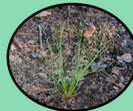
New growth of longleaf pine seedlings begins